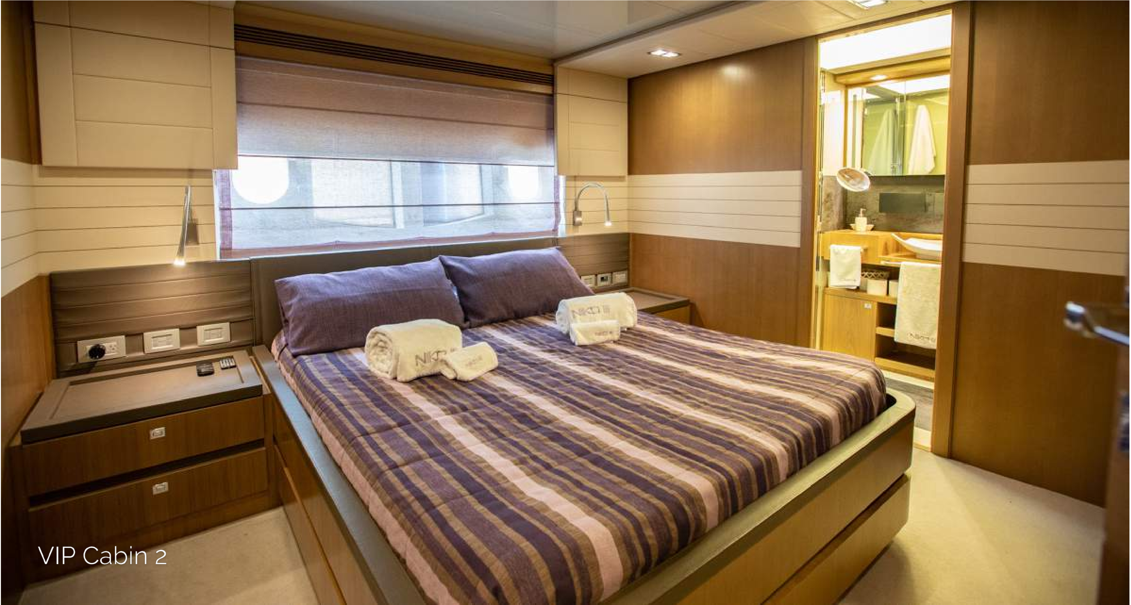
VIP Cabin 2