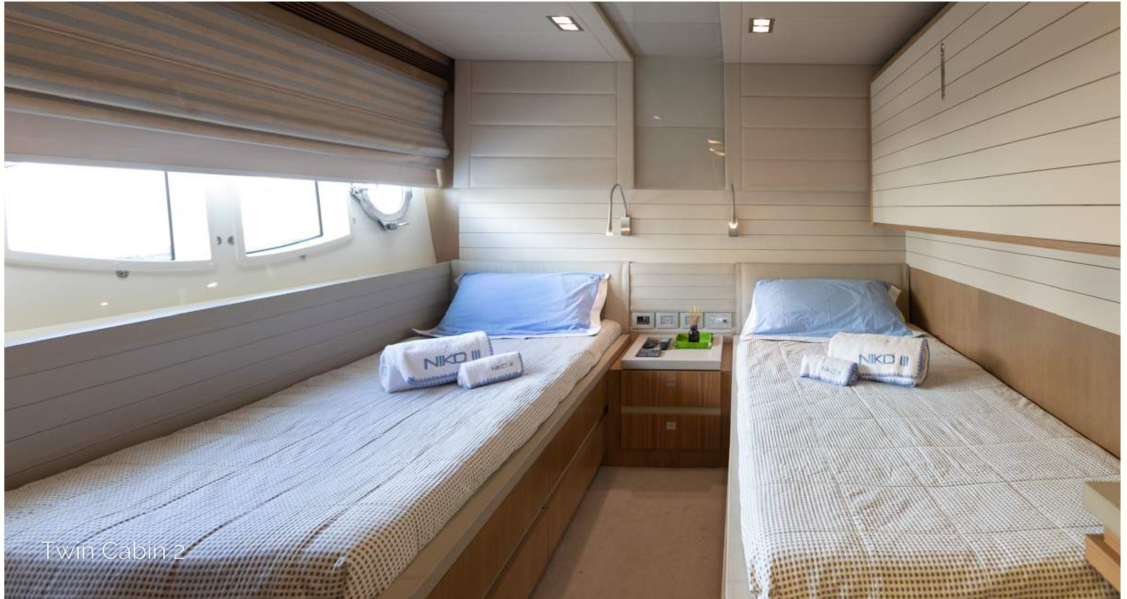
Twin Cabin 2