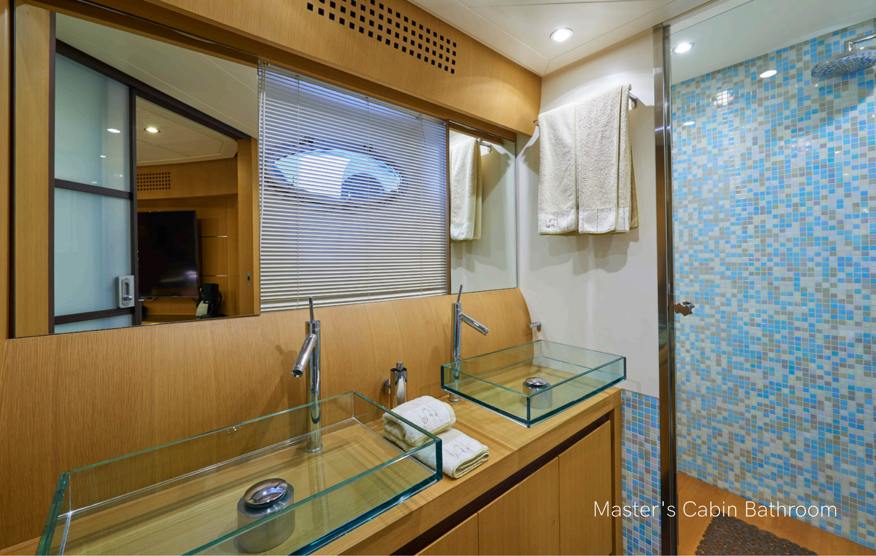
Master's Cabin Bathroom