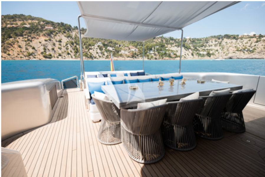
Aft deck dining