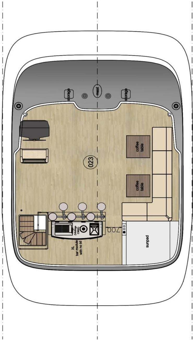
Flybridge arrangement TBD